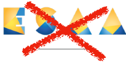
REPLACING / MISSING ELEMENTS